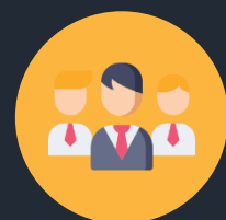
Customized Consulting Services