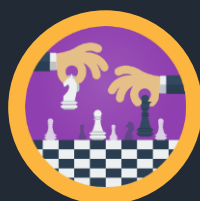
Customer & Competitor Intelligence